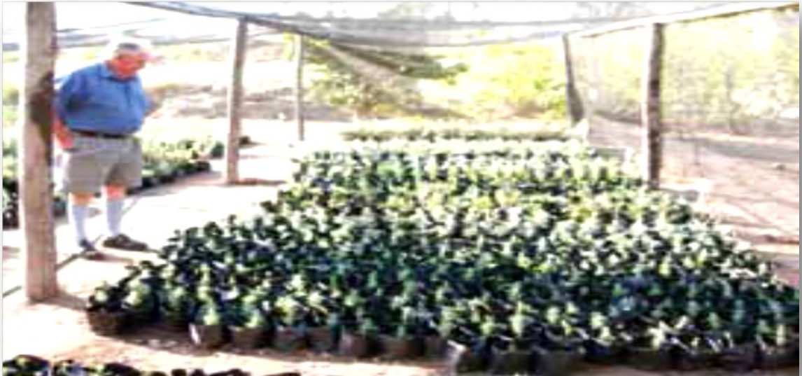
Lavender ready for transplanting