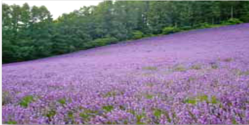
Lavender plantation on slopes