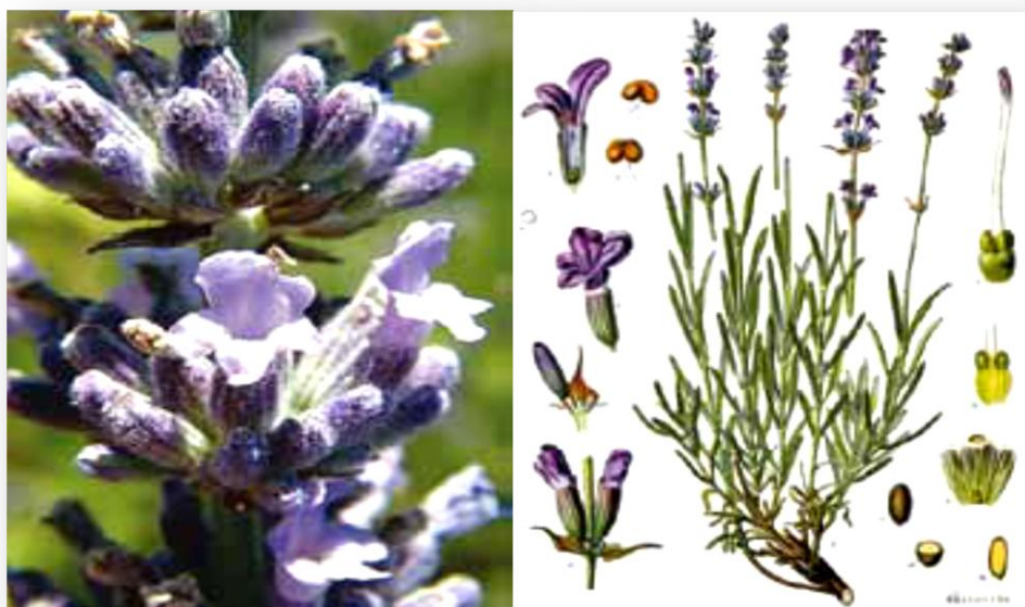
Lavandula angustifolia (English/True lavender)

The plant parts used for oil distillation are the flowers and, in smaller quantities, leaves. Essential oil from only the flowering tops is of higher quality than oil obtained from the leaves. For dried flower production the flowers with stems are cut longer.