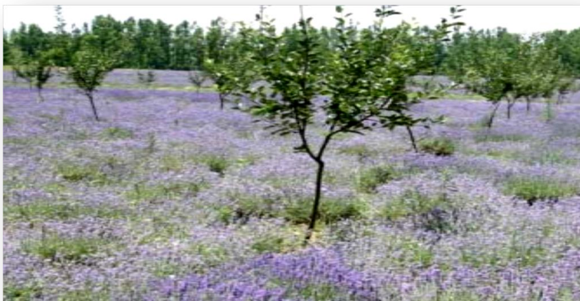
Lavender plantation in apple orchards as an Intercrop