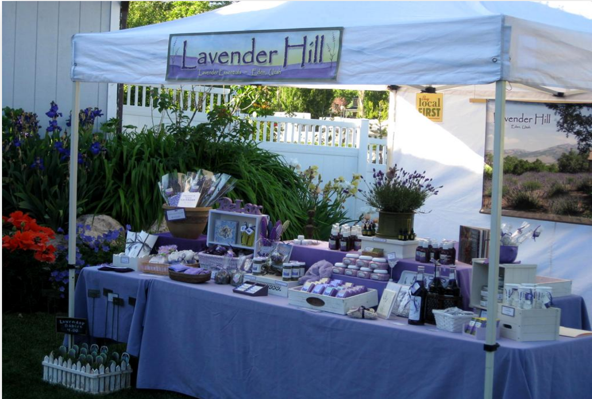
Lavender products on display

are able to kill many of the frequent bacteria such as typhoid, diphtheria, streptococcus and pneumococcus, as well as being a powerful antidote to some snake venoms. It is very useful in the treatment of burns, sunburn, scalds, bites, vaginal discharge, and anal fissure. The essential oil is used in aromatherapy. The leaves are also added to bath water for fragrance and their therapeutic properties.