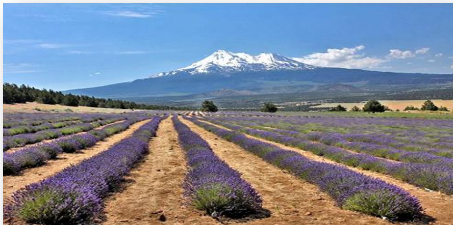
Lavender plantation in uniform rows

Lavender is normally planted in row widths of 1 to 2 m apart, with 30 to 60 cm spacing between the plants, which gives a plant density of 8000 to 10000 plants per hectare. Spacing is done according to available moisture and species, and cultivar size as well as for mechanical cultivation and harvesting. Higher densities mean higher establishment costs but also higher early yields. Plants also tend to support each other, so are more stable and last longer. A good vigorous plantation should be ready for harvest in the second year. Lavender plants can last for 10 to 15 years or longer if managed correctly. Seedlings should be hardened off before being put into the land.