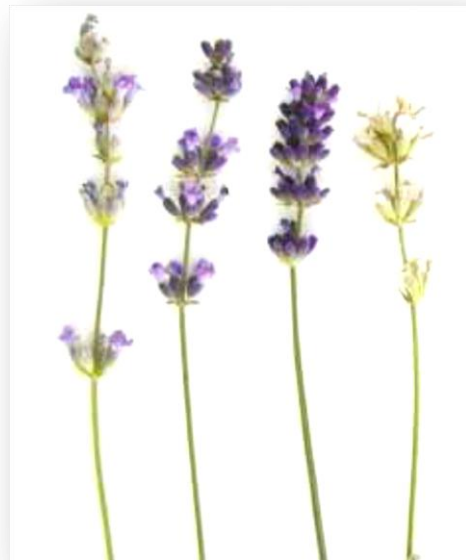
True lavender cultivars

The lavender essential oils are each unique in composition and used in different applications.